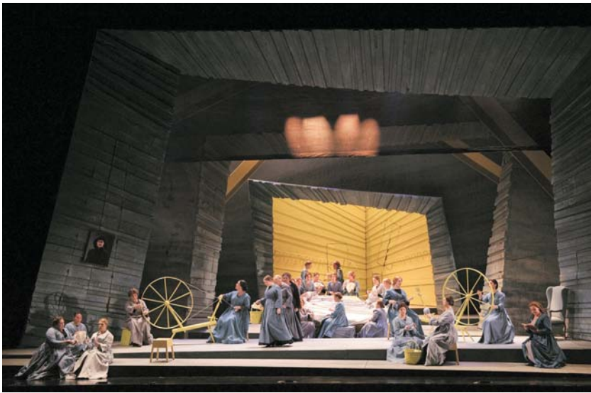
The Spinning Chorus Act II.