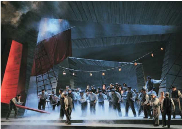
The Drinking Song Act III.

During the final measures from the orchestra, the curtain fell, and the Dutchman and Senta walked on from opposite sides and embraced as the music came to its conclusion.