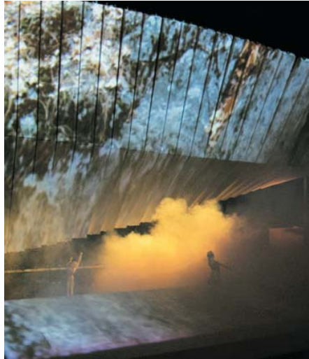
Set model from Robert Legage's production of Das Rheingold .

The Metropolitan Opera's Highly Anticipated new production of Das Rheingold in High Definition