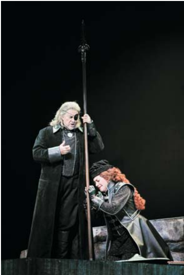
Die Walküre , Act III by Hawaii Opera Theatre

I attended the matinee performance in Honolulu on February 14, 2010. I was prepared for a mediocre show because a friend of mine, a French horn player and a graduate from Julliard School of Music, knows what is going on with regional opera houses and told me that Hawaii, like other regional opera houses, is having financial constraints, and that many musicians were leaving the scene. It was a welcome surprise, then, to see the orchestra pit filled with players and a confident audience that almost filled the auditorium to capacity.